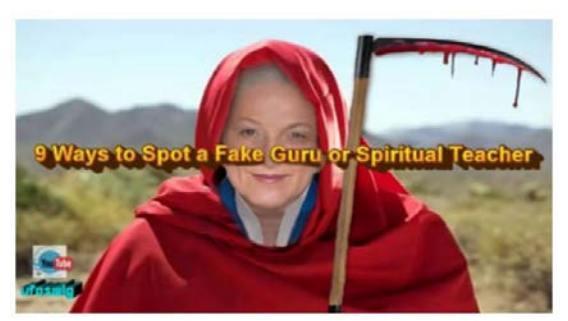
Nine ways to spot a fake guru.

For more information about Patton West and her cult / criminal racketeering gang and her activities in Montana please view the following web pages:-